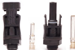
ESC-4-PM 30A, 1500VDC, IP68, TUV, 2.5/4/6 sq.mm., Panel Mount