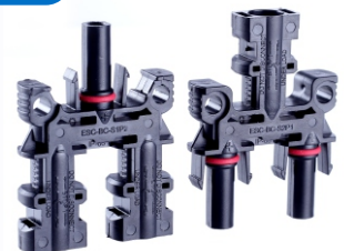
ESC-BC-S1P2, ESC-BC-S2P1 30A, 1500VDC, IP68, TUV