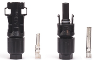
ESC-4-UW 30A, 1500VDC, IP68, TUV, 2.5/4/6 sq.mm., Safety Window