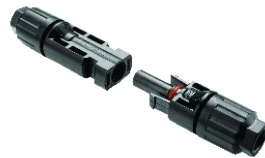
ESC-4 30A, 1500VDC, IP68, TUV, 2.5/4/6 sq.mm.